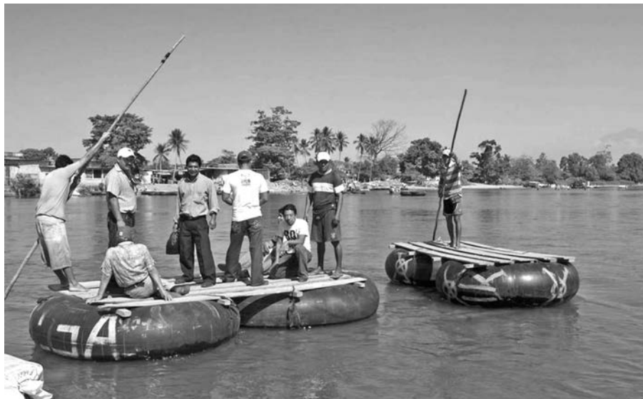
Crossing the Suchiate River.

People don't only leave their country because of poverty; they also leave because of insecurity, and the violence of the "Maras."