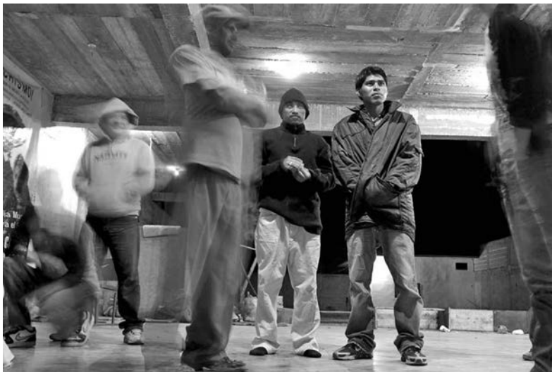
Migrants wait in one of the many shelters that help them in Mexico, most run by non-governmental organizations.

The ones who come to the shelters are the poorest, and among them, the most vulnerable are the women.