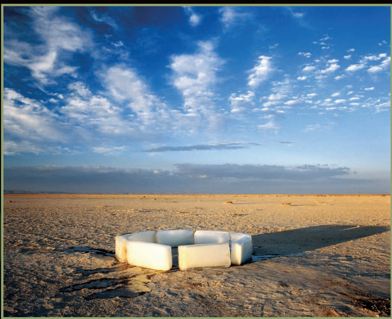
Polar Circle in the Desert. 1999. Replenishing Emptiness Series

De Stéfano polished the resources to aestheticize the perception of space and time using metaphorical, dramatic elements; aestheticizing also implies reproducing reality as fiction.