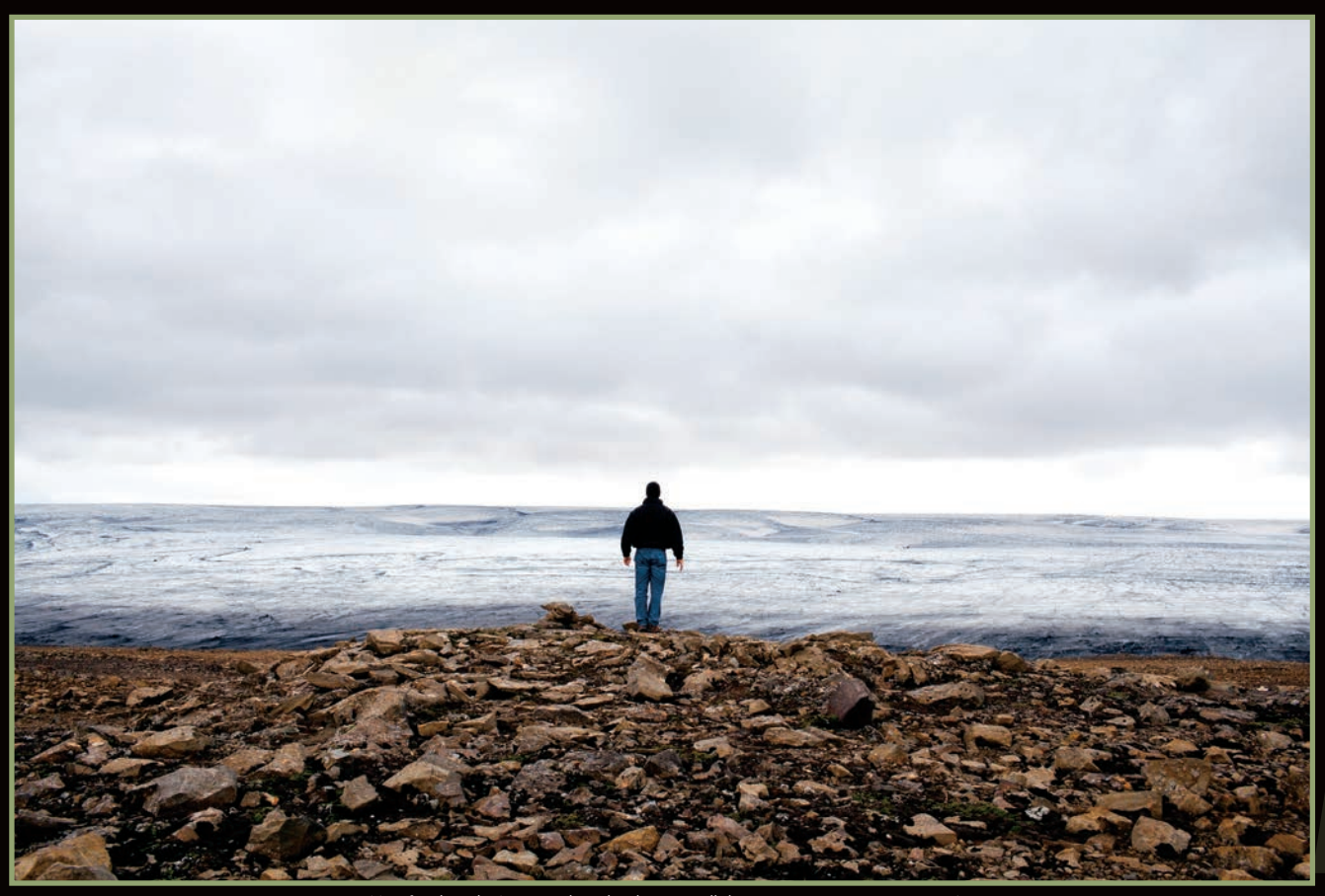
Waiting for the Glaciar to Melt, Iceland, 2011. All the Deserts Are My Desert Series.

Little by little, this photographer has taken us to an image of the desert as a space colonized by the human presence.