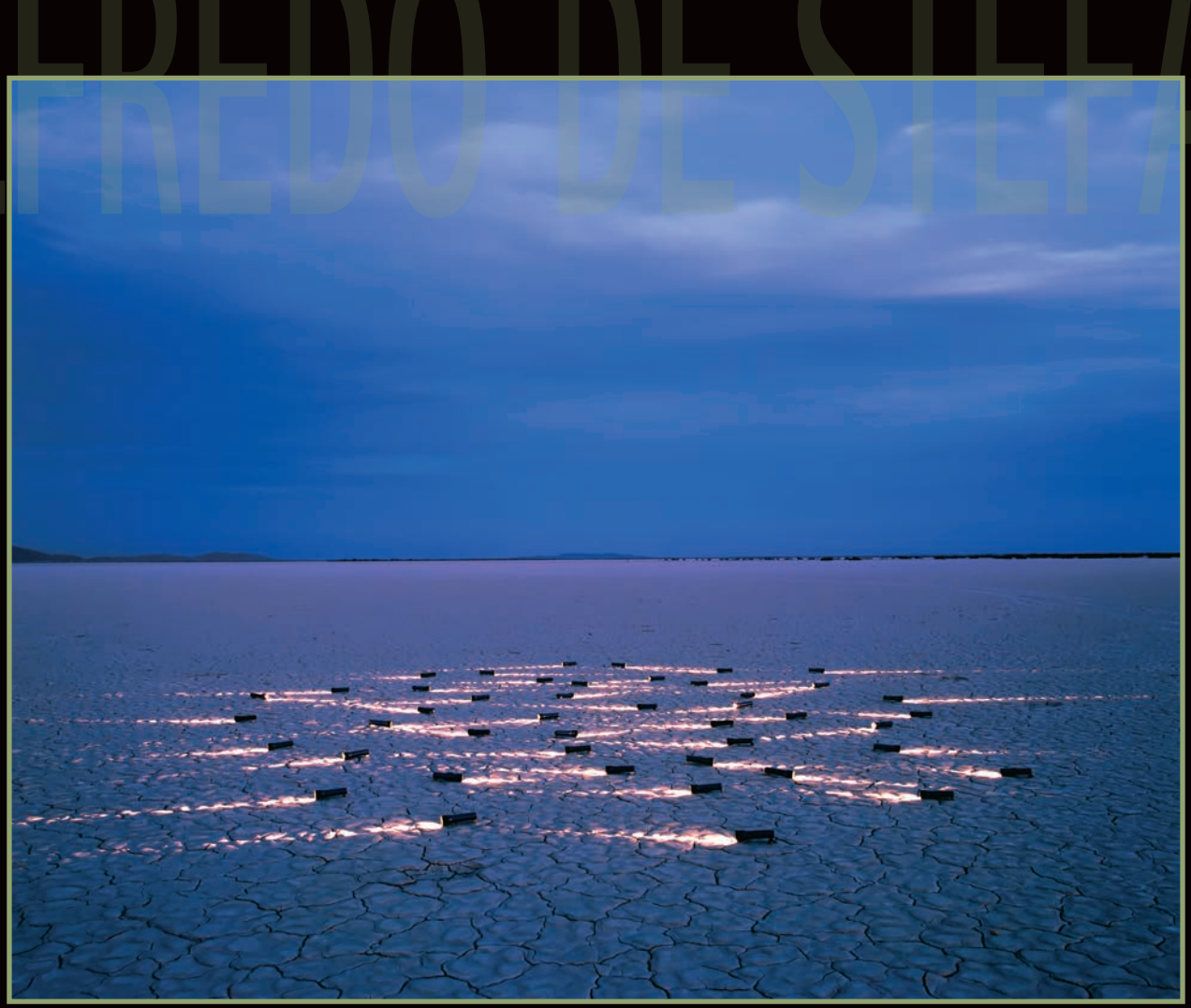
Fireflies, 2003. Brief Chronicle of Light Series.

We could force the reading of some of those images to find certain implications of violence; that would also help us more precisely define the ecologist discourse often imposed