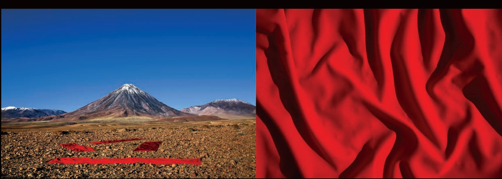
Blood Offering to the Licancabur-Atacama Desert, 2008. All the Deserts Are My Desert Series.

For that reason, I have called these photographs "inscriptions on the landscape," although this concept must not be separated from the notion of intervention. If in a previous