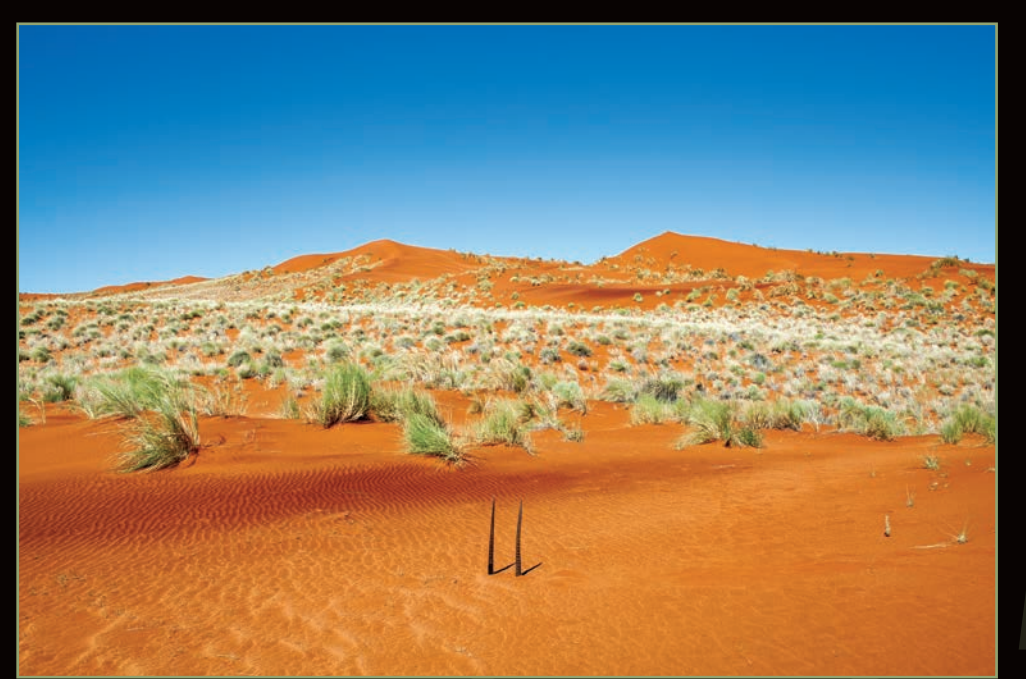
Orix-Namibia Desert, 2011. All the Deserts Are My Desert Series.