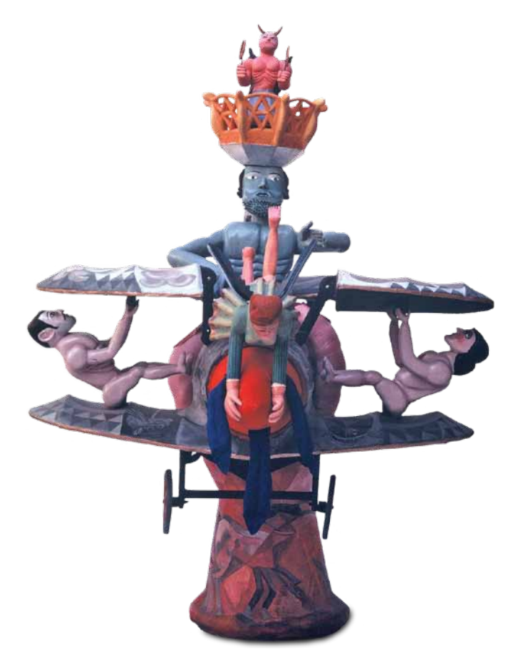
The Archangel Gabriel with Adam and Eve, Holding the Wings of Masturbation, God in Command, and the Hand of the Virgin, Too, 180 x 160 x 150 cm, ca. 1971 (multicolored wood, papier-mâché, and objects). Whereabouts unknown.