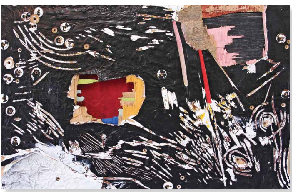
▲ Border Town, 19" x 29", 2006 (acrylic on panel)