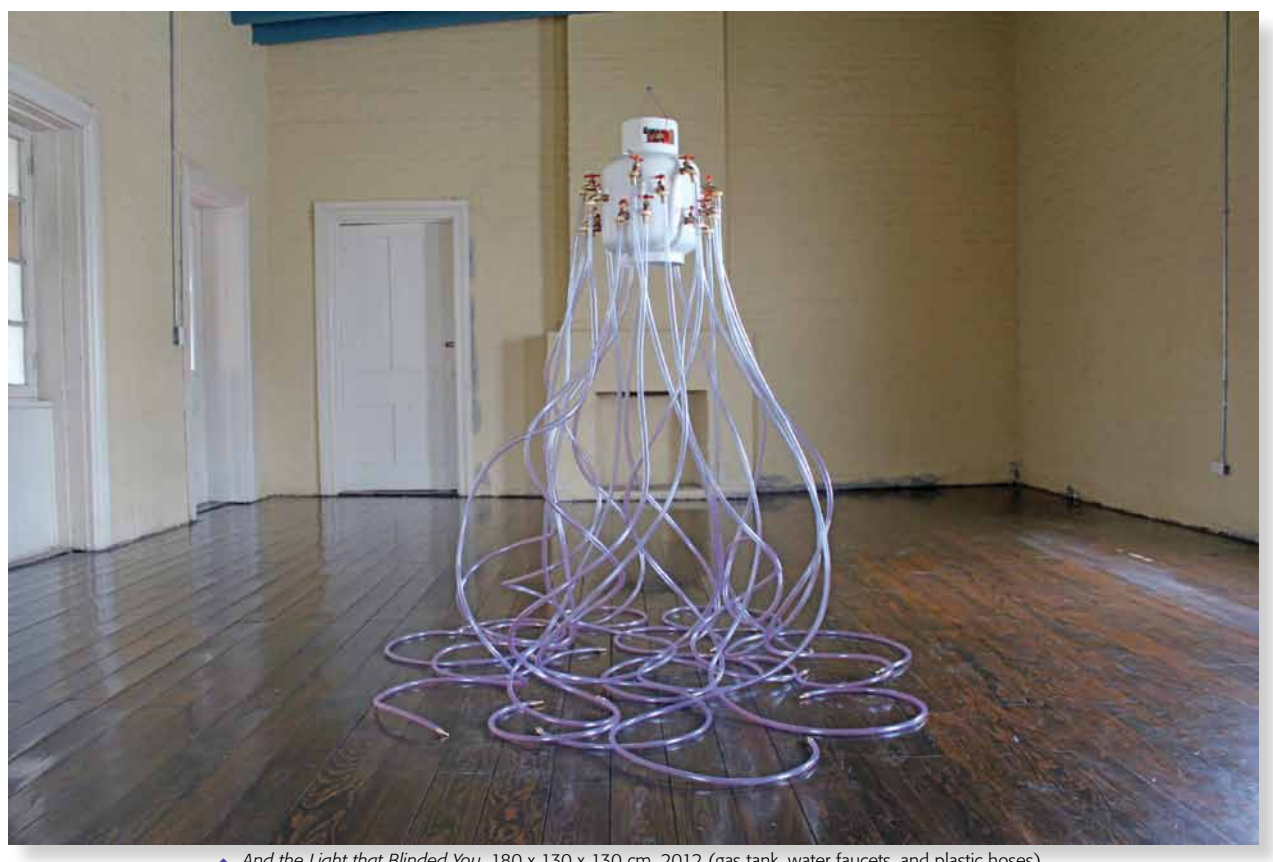
▲ And the Light that Blinded You, 180 x 130 x 130 cm, 2012 (gas tank, water faucets, and plastic hoses).