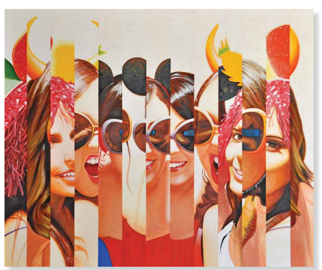
▲ History of It-Might-Have-Been, 110 x 130 cm, 2013 (oil on canvas)

Matamoros has always been considered the city in Tamaulipas most inclined to embrace contemporary trends and the ways of exploring beyond the conventional.