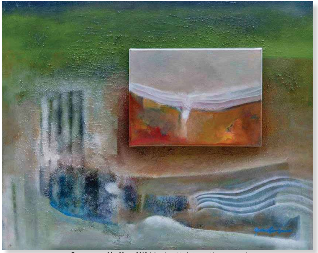
▲ Tamayo-esque, 90 x 60 cm, 2012 (oil and marble dust assemblage on canvas).