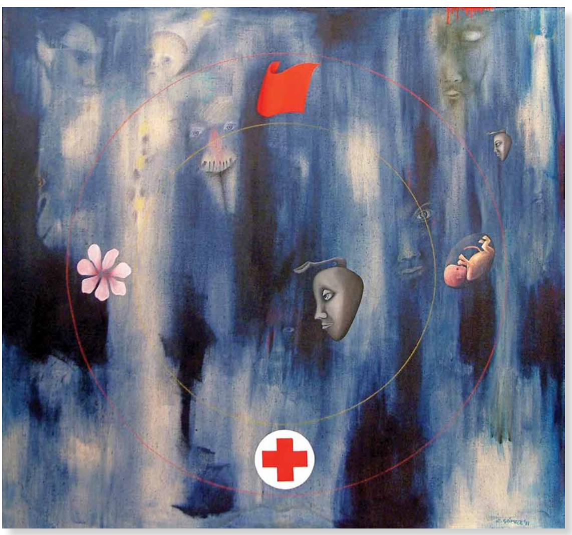
▲ Life Has No Mercy for Mexicans, 58" x 54", 2011 (mixed media on linen). From the "Handsome Pepper Series."