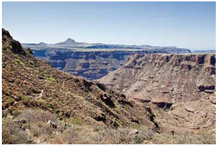
The way to San Francisco de la Sierra is covered with canyons and plains.