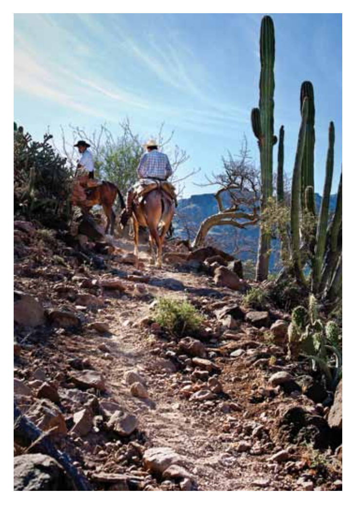
The sheer size of El Vizcaíno Reserve makes it possible to enter into contact with a wide diversity of ecosystems, landscapes, inhabitants, and settlements.

will only look at the region of the San Francisco Mountains as a central point for visiting the rock paintings. However, it is not the only area that boasts this cultural heritage: in the Guadalupe Mountains in Baja California Sur, and in the San Juan and San Borja Mountains in Baja California, many other rocky crags and caves also have rock paintings.