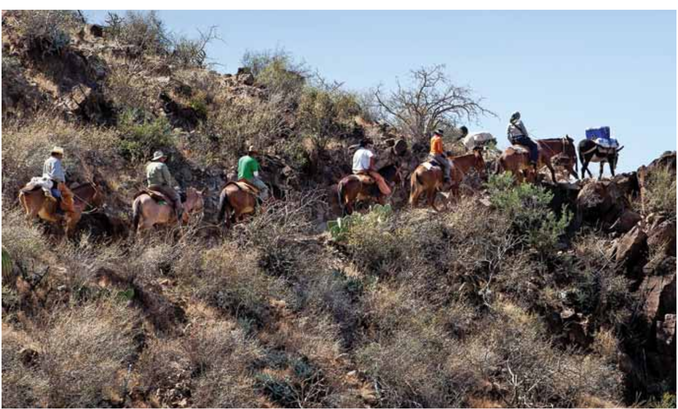
Local guides lead a caravan to the murals.

Usually, a trip through one of the canyons takes three days and costs less than US$250, including the pay for the guide, the animals that transport the visitors and carry the food, and the camping gear.