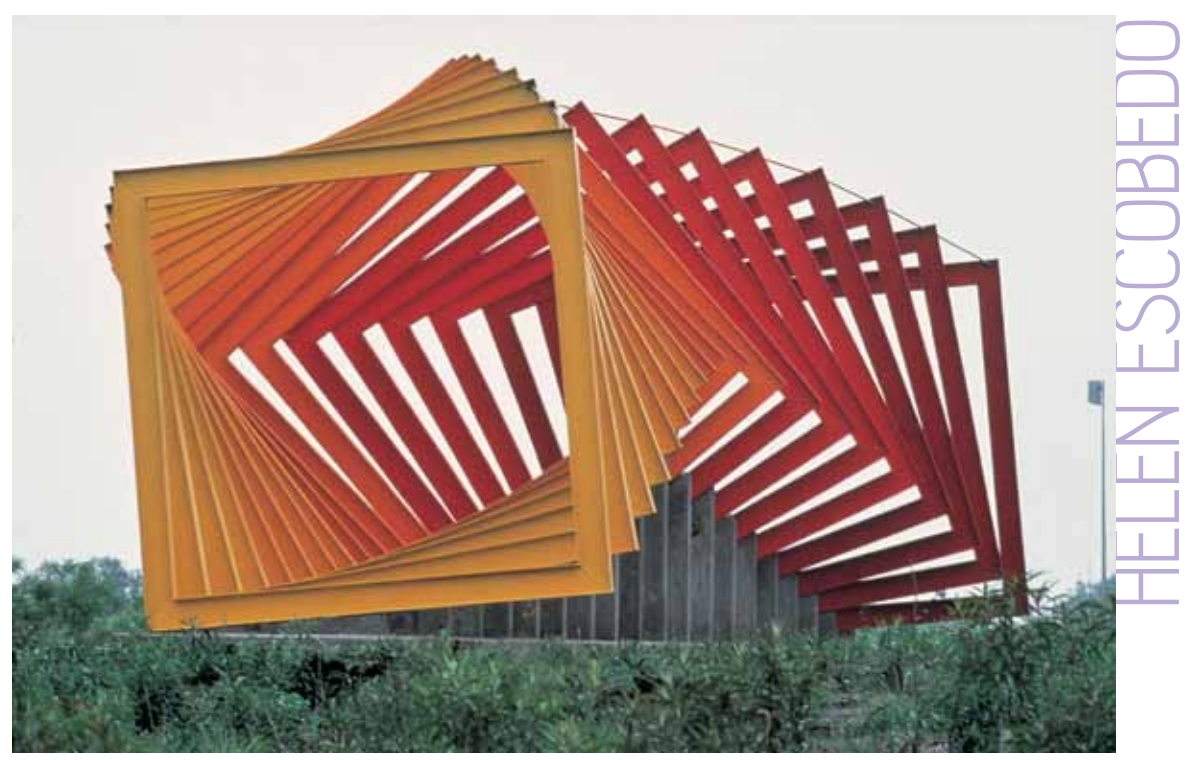
Coatl, 3 x 15 x 3 m, 1980 (steel). UNAM University Cultural Center.