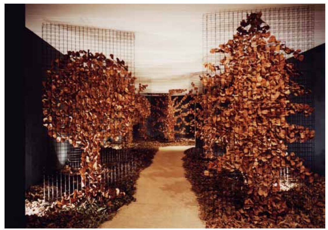
Helen Escobedo, The Death of the Forest , 2.50 x 7 x 4 m, 1990 (iron lattices and dried leaves). Lebanese Center Gallery.