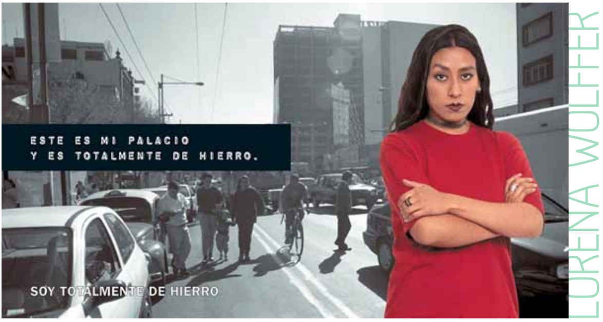
I Am Totally of Iron, 2000 (iron frames and printing on paper). Different public spaces.

Each of Lorena's projects, whether performance art, a survey, or a billboard, tries to build an intermediate space between art and activism; to generate immediacy and communication with the public; to lead to questions about the construction of gender indentity.