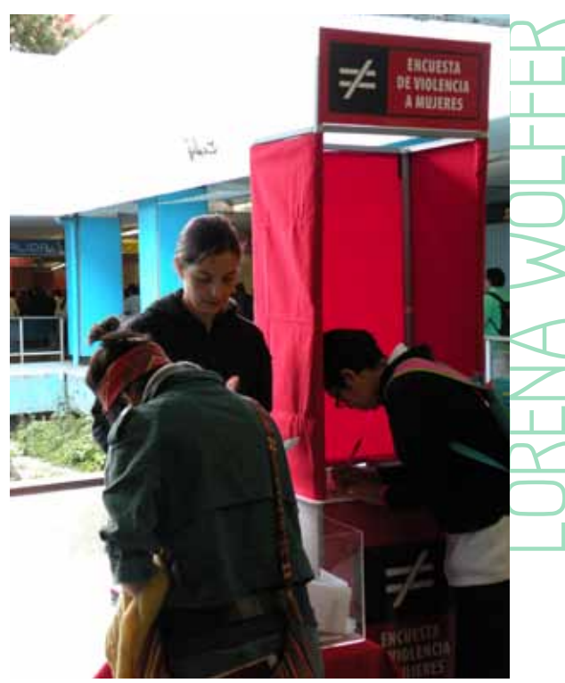
Survey of Women about Violence, Mexico City's central Zócalo Square, 2008. Bus and subway stations, Jamaica Market, Academia Street, in downtown Mexico City.

The complement to that monument, but this time an individual work, was her steel sculpture Coatl (1980), a penetrable, transparent serpent with the colors of fire spread along the stony walk in University City. Transparency was a